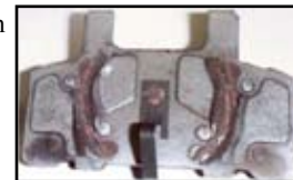
WAGNER ThermoQuiet damage

Performance tests found the piston rapidly cuts through the IMI shim which may cause increased pedal travel, deteriorating pedal feel and potential noise. Once the IMI material is cut through it loses its ability to dampen noise.