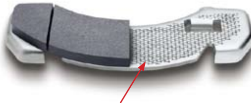
Raybestos mechanically attached steel backing plate.