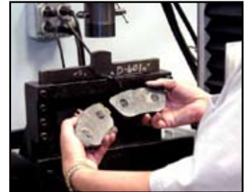
Our engineers conduct shear testing on Raybestos and competitive disc pads. This test measures the amount of force required to "break off" the friction material from the steel backing plate.