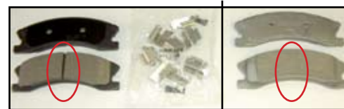
RAYBESTOS PROFESSIONAL GRADE

Wagner’s MX 945 has IMI shim design and is missing slots and a hardware kit. The comparable Raybestos Professional Grade part features premium attached shims, slots, and chamfers where needed to match OE design. Abutment clips are included where required.